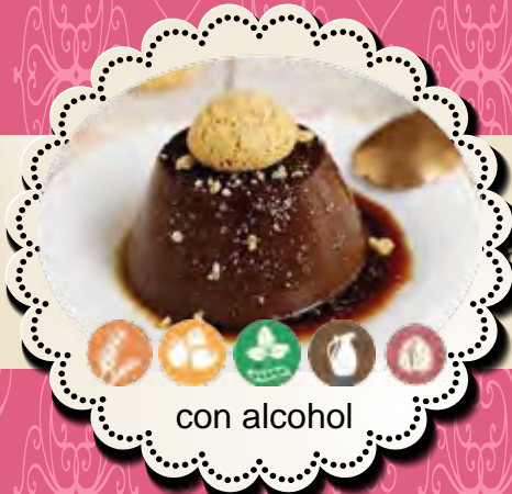
Bonet piemontese 4.50€- Casero -Pudin de cacao al ron y amaretti Home-made, Chocolate Rum pudding with amaretti biscuits