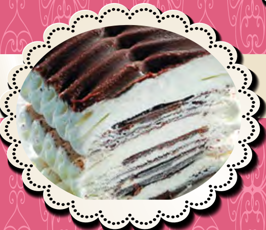
Contessa 4,50€ Ice-cream cake