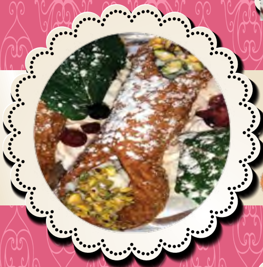
Casero - Cannoli siciliano 3,50€und Home-made, Scicilian Cannoli 3,50 each